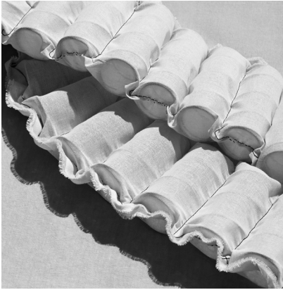
Making the springs.