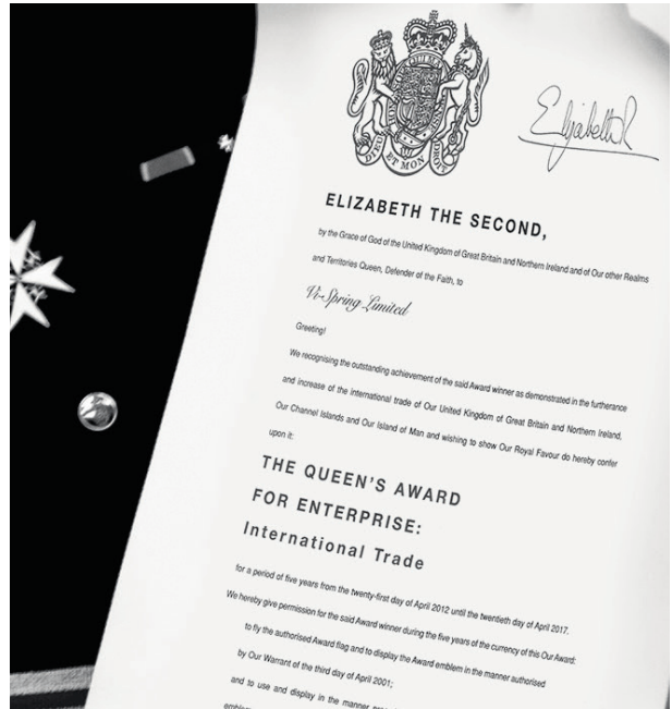
2012, Queen's Award for Enterprise.