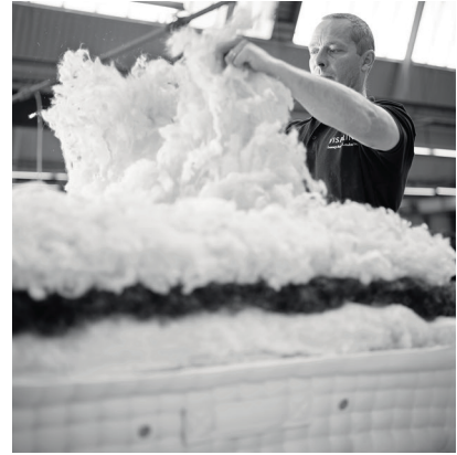
Assembling the fillings.