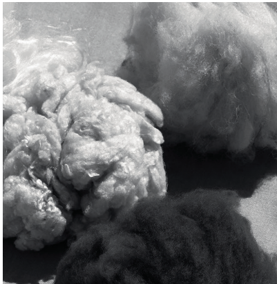
Finest natural fillings.