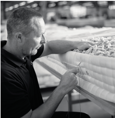
Genuine hand side-stitching.